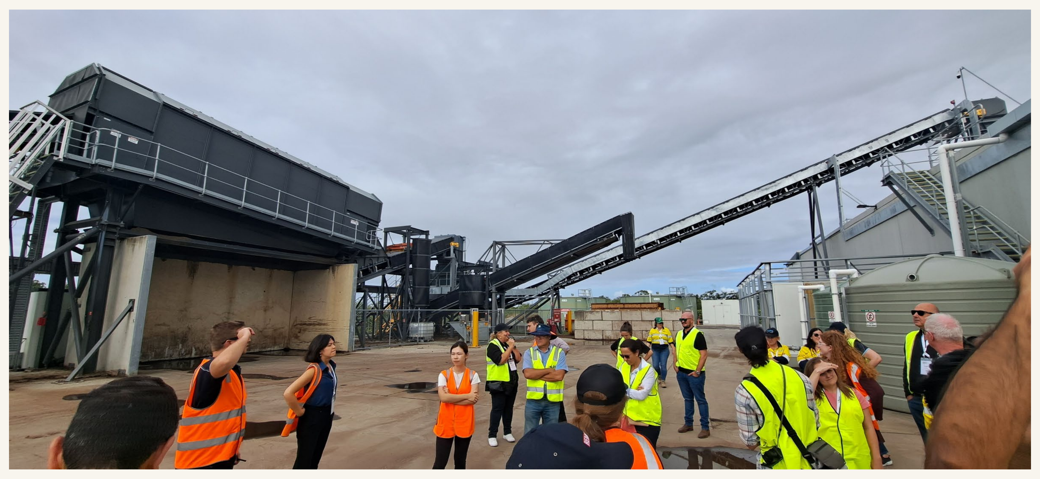
Phoenix Power Recyclers