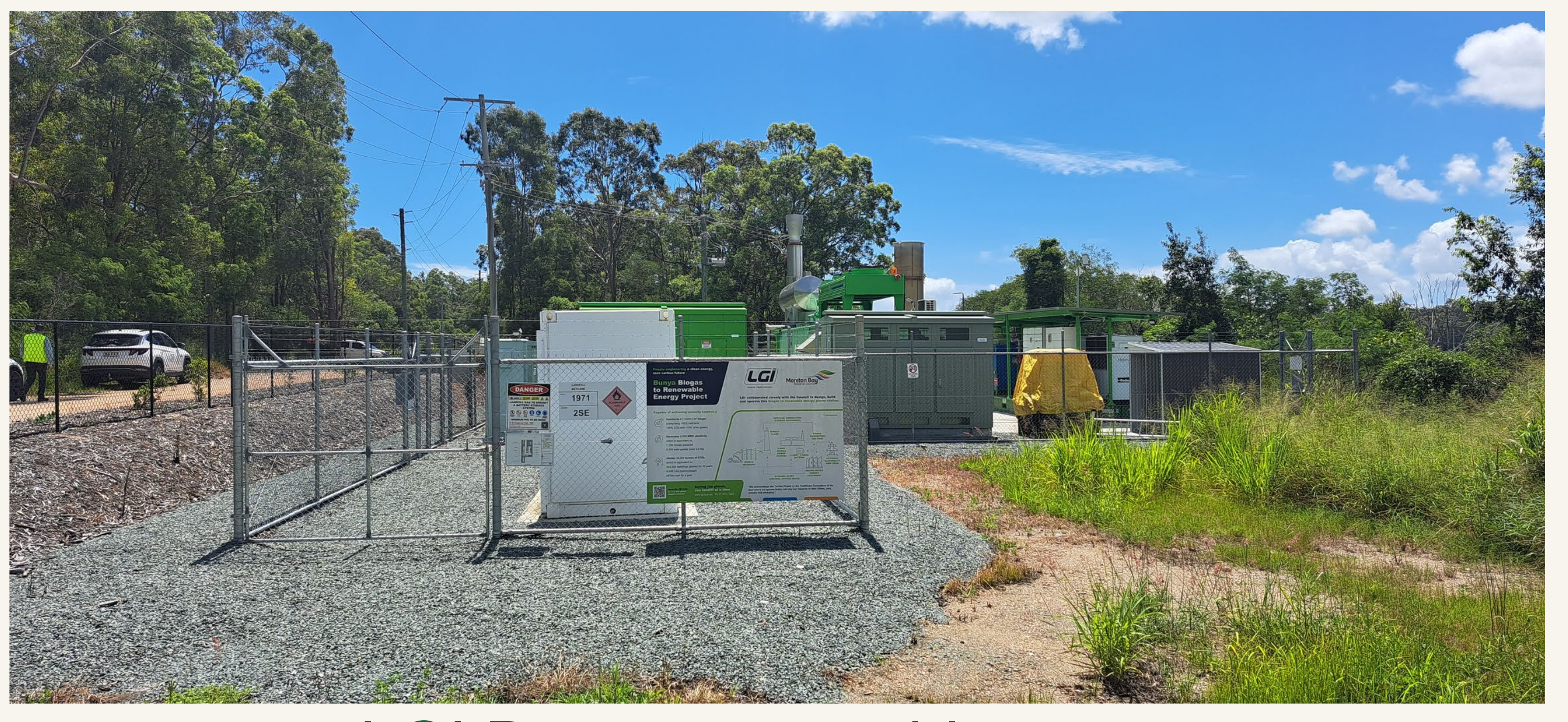
LGI Bunya renewable power station