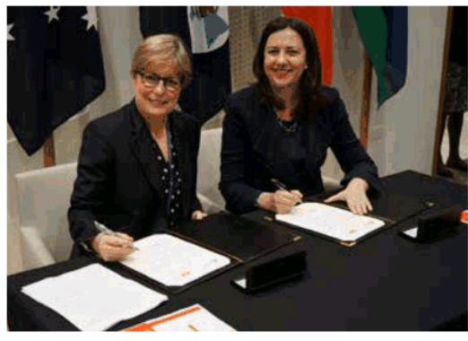
MINISTERIAL AND GOVERNMENT BRIEFINGS

The 18 May meeting also saw the presentation to the Premier of the QFI Future State Document Ideas and Solutions 2027.