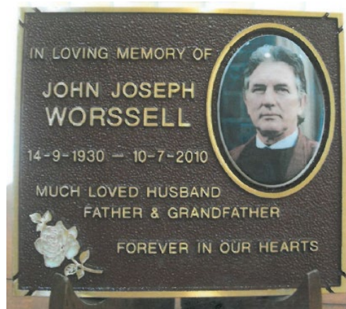
Figure 4 Standard Small Plaque, Standard Border, Burgundy Background, Ceramic Photo, Rose Emblem Painted White