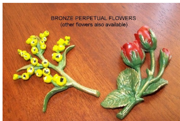
Figure 6 Bronze Perpetual Flower Samples