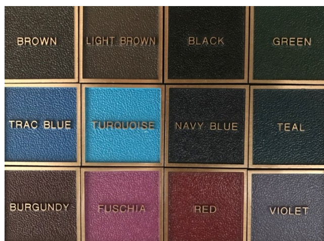
Figure 2 Plaque Background Colours