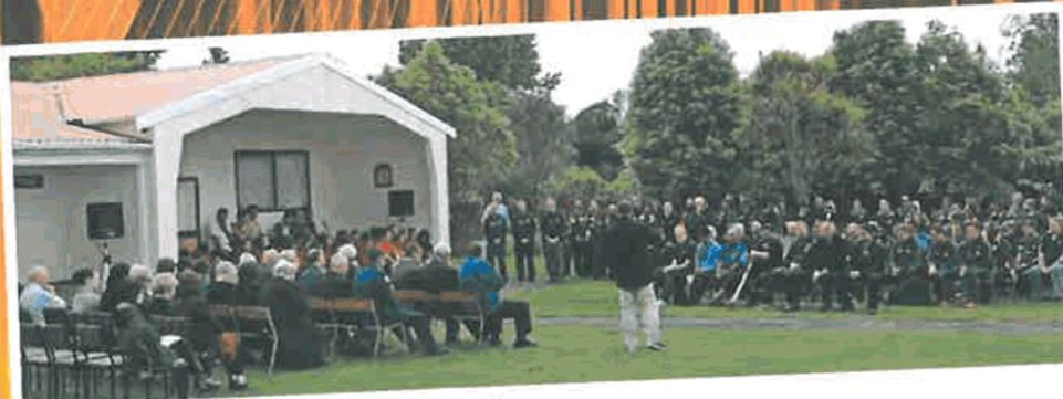
Teams attended an official welcome at the Whakaahurangi Marae in Stratford