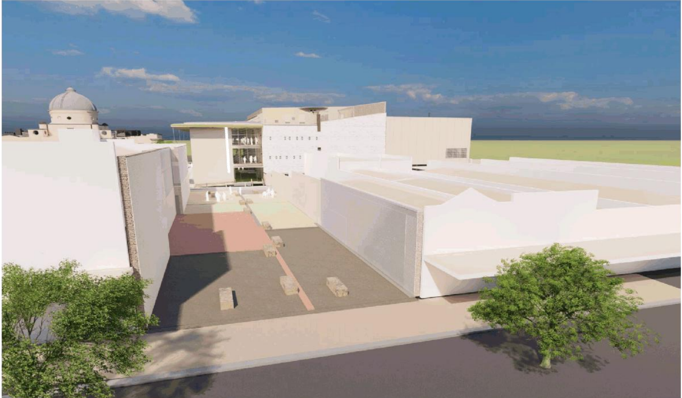
Sheet 6 of 6