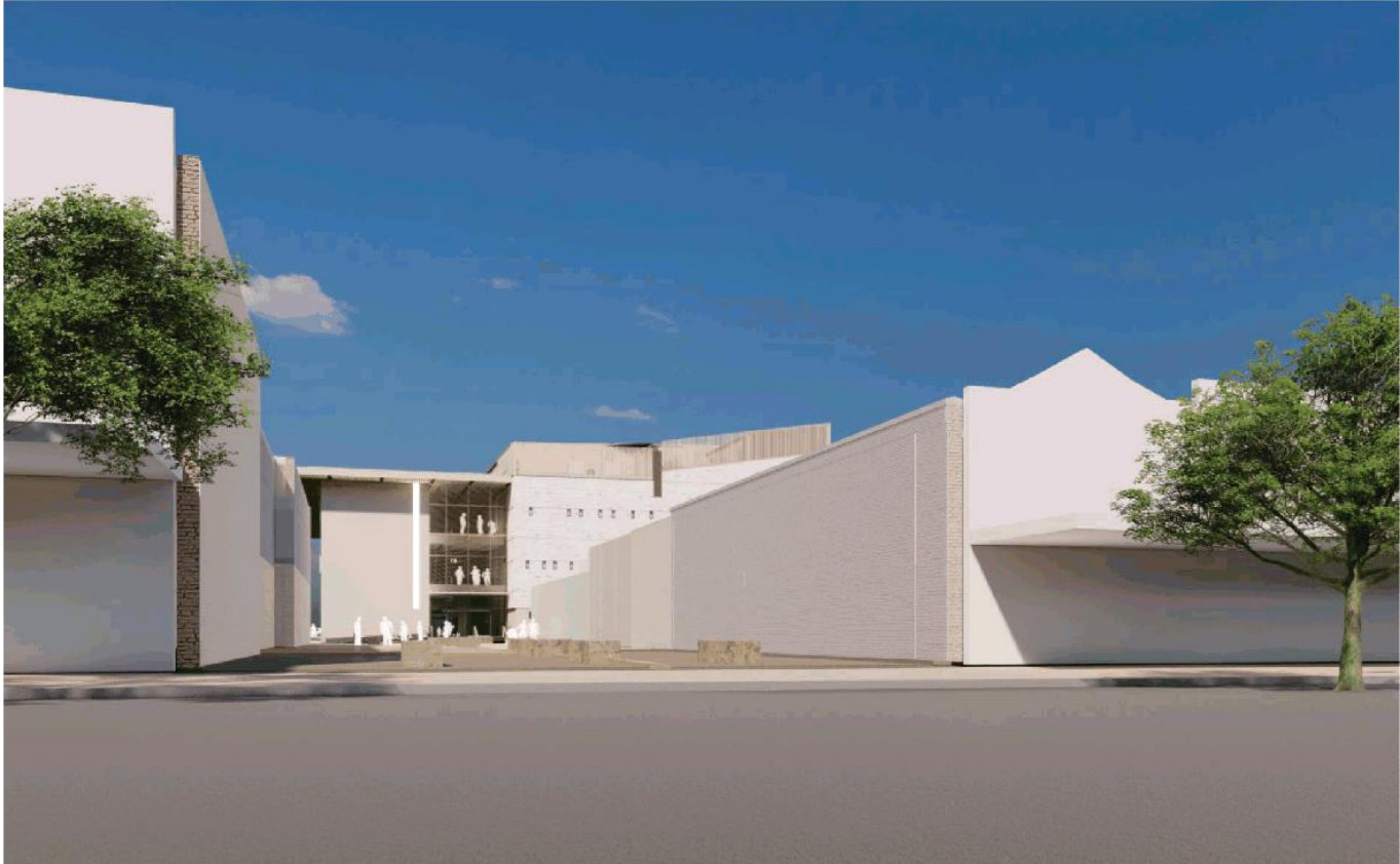
Sheet 5 of 6