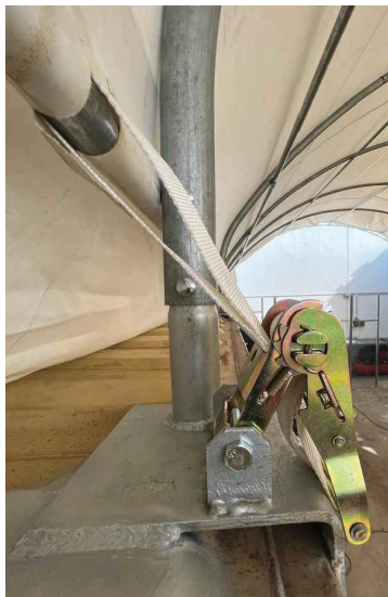
VIEW SCALE 1: NTS