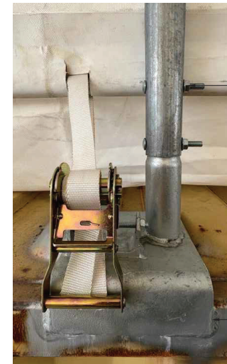
DETAIL SCALE 1: NTS