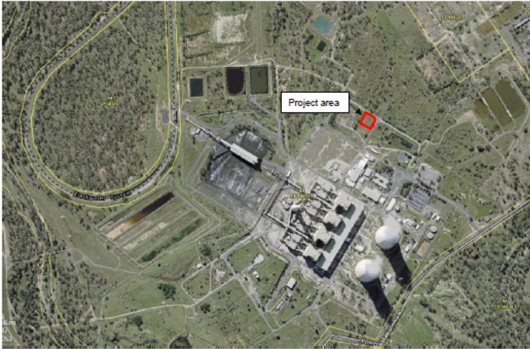
Figure 1 Site location