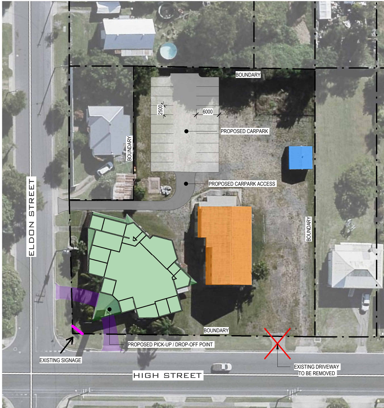
1 PROPOSED SITE PLAN 1 : 500 @ A3