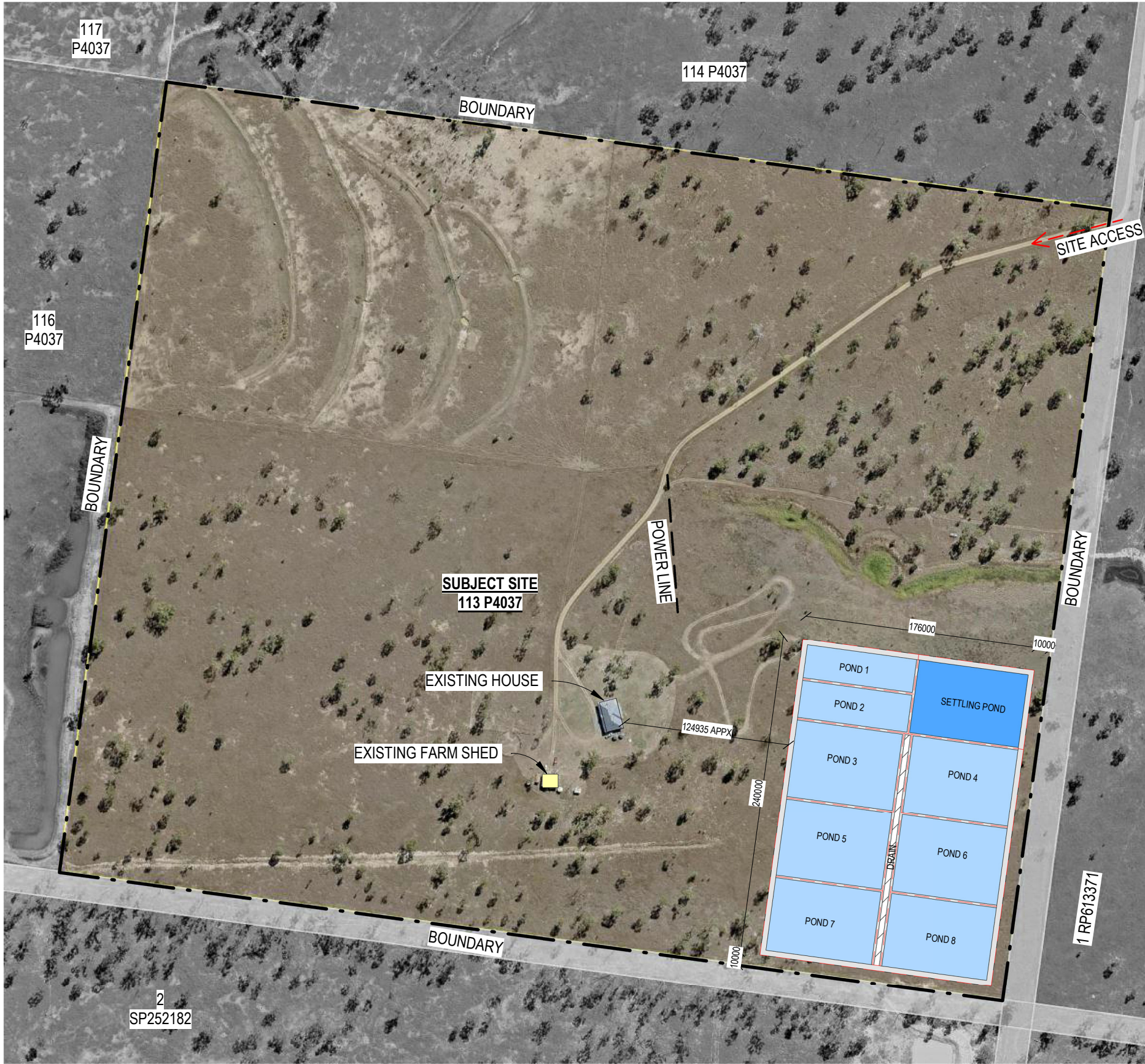
1 SITE PLAN 1: 3500 @ A3

GENERAL NOTE: - THESE DRAWINGS ARE PART OF A TOWN PLANNING APPROVAL APPLICATION AND SHOULD NOT BE USED FOR ANY OTHER REASON - THESE DRAWINGS ARE APPROXIMATE AND HIGHLY CONCEPTUAL - TRAFFIC/STORMWATER/OPERATIONAL WORKS: AS PER CIVIL ENGINEER DOCUMENTS AND DRAWINGS IF REQUIRED - CURRENT LOCATIONS AND BOUNDARY LINE ARE APPROXIMATE, RELEVANT SURVEY TO BE CONDUCTED BEFORE ANY DOCUMENTATION OR CONSTRUCTION - REFER TO TOWNPLANNING APPLICATION AND OPERATIONAL WORKS DOCUMENTATION WHEN VIEWING THESE PLANS - THESE DRAWINGS ARE CONCEPTUAL AND DO NOT REFLECT BUILDING APPROVAL, PLUMBING APPROVAL, QFRS APPROVAL OR DISABILITY REQUIREMENTS. CLIENT TO CONFIRM AND GET APPROVAL FROM RELEVANT AUTHORITIES - IF THE SITE OR PROJECT ARE TRIGGERED OR LOCATED IN BUSHFIRE AREA, THEN THE BUILDINGS TO COMPLY WITH BUSHFIRE REQUIREMENTS OR AS PER COUNCIL REQUIREMENTS