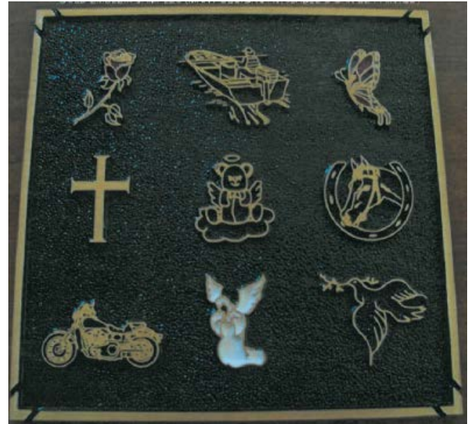
Figure 3 Gold Emblem Samples (can be painted)