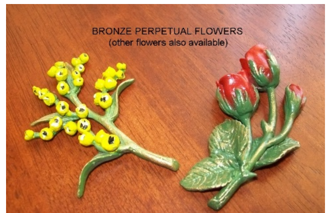
Figure 6 Bronze Perpetual Flower Samples