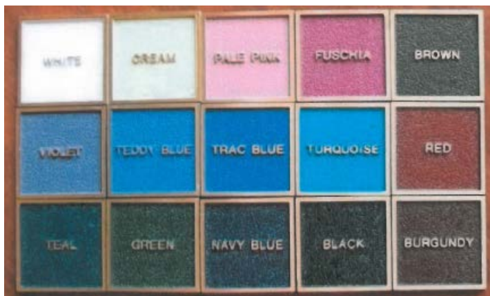
Figure 2 Plaque Background Colours