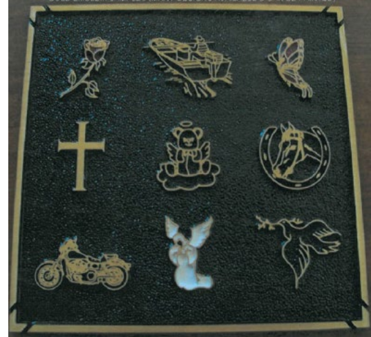
Figure 3 Gold Emblem Samples (can be painted)