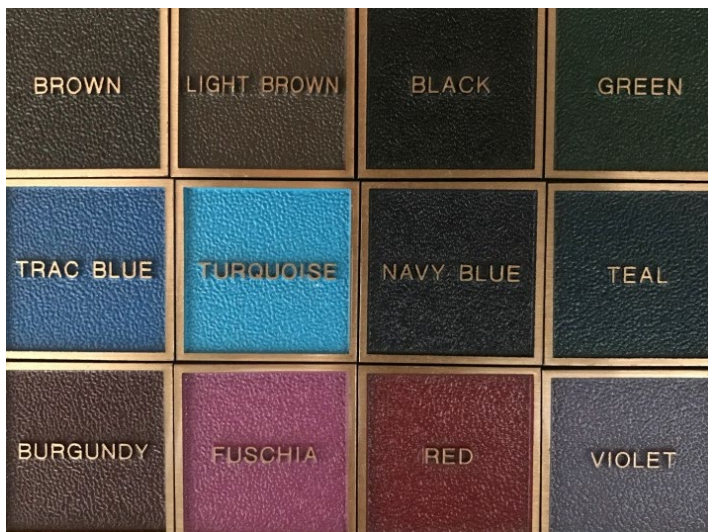
Figure 2 Plaque Background Colours