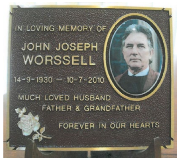
Figure 4 Standard Small Plaque, Standard Border, Burgundy Background, Ceramic Photo, Rose Emblem Painted White