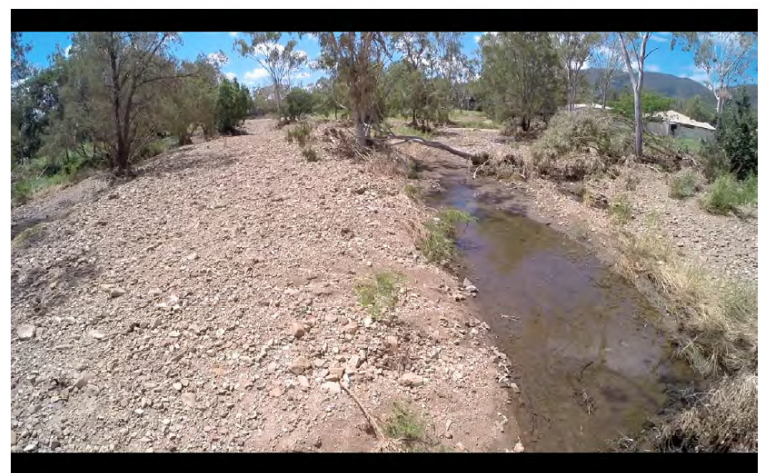
mage taken on 03/03/2015