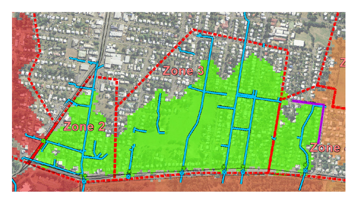
Stage 1 North Rockhampton Flood Mitigation – Flood Valves (actual photo)

Map of properties in Berserker protected in Stage 1 of the project