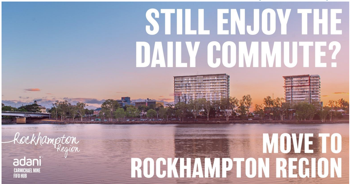
FIGURE 1: EXAMPLE OF INDUSTRY CAMPAIGN (BILLBOARD)