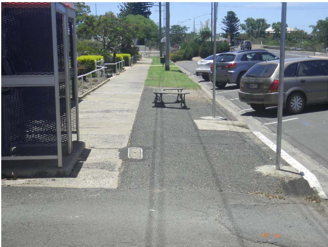
Concrete / Asphalt Footpath –Towards North