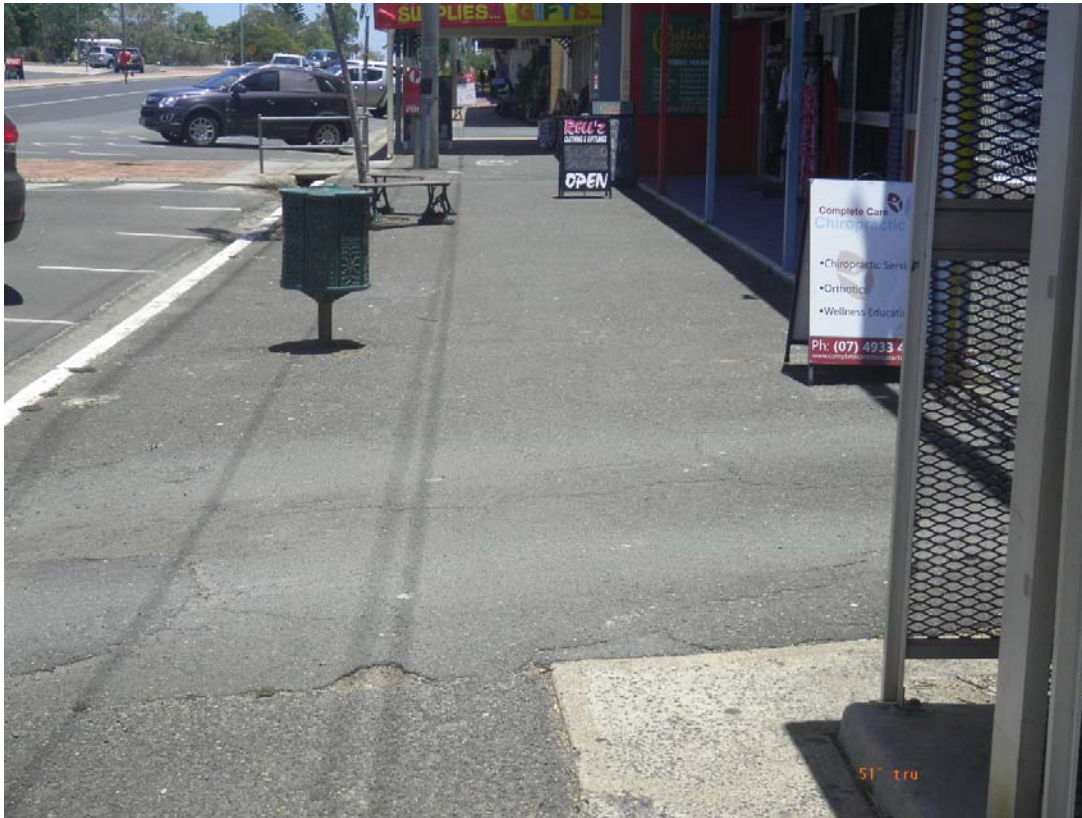
Footpath – Asphalt Example