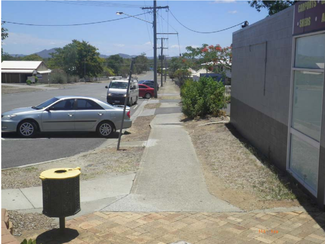
Concrete Footpath – Russell Street