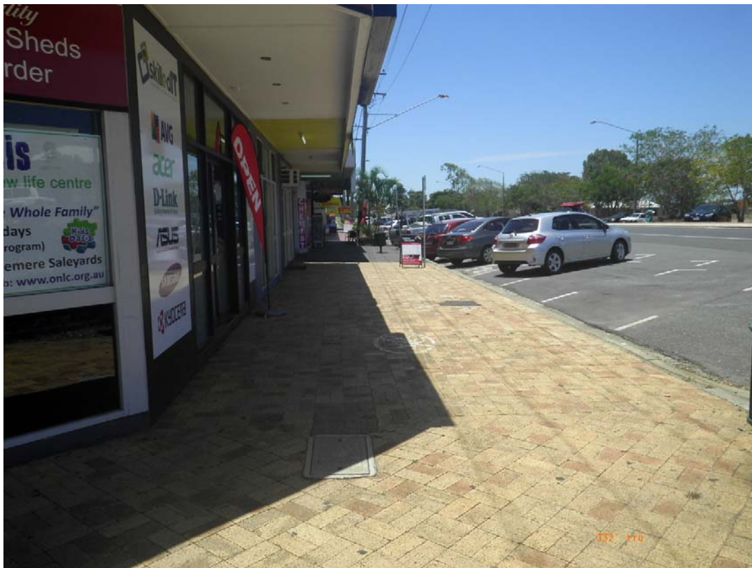
Footpath – Pavers Example