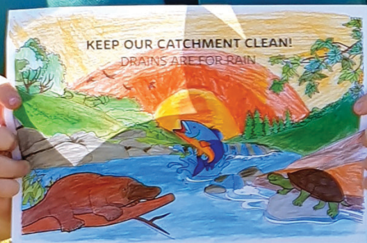
Berserker State School | Rockhampton Region