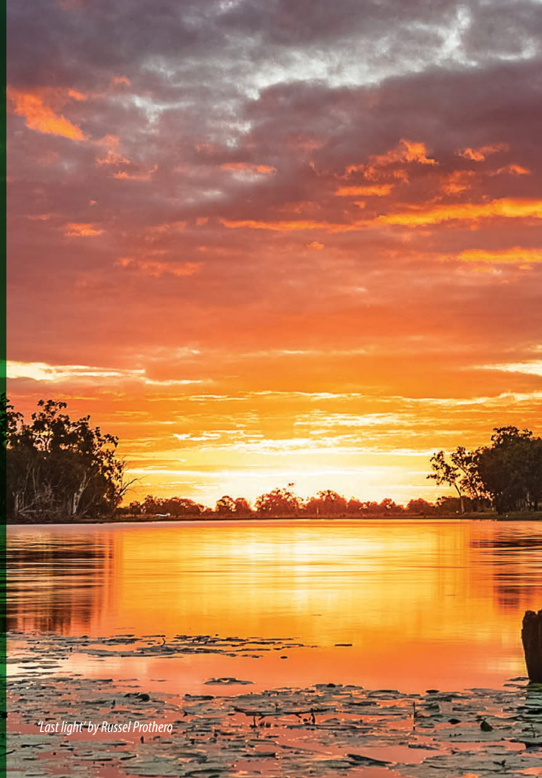
'Last light' by Russel Prothero

In pursuing this sustainability journey, Council will work together with our local residents, communities, businesses, industries and other levels of government to lead a variety of strategic actions via four pathways. Underpinning the pathways are key strategic priorities that will help the Rockhampton Region to prioritise a healthy natural environment, transition towards net zero emissions, create a climate resilient region and build a low-carbon circular economy.