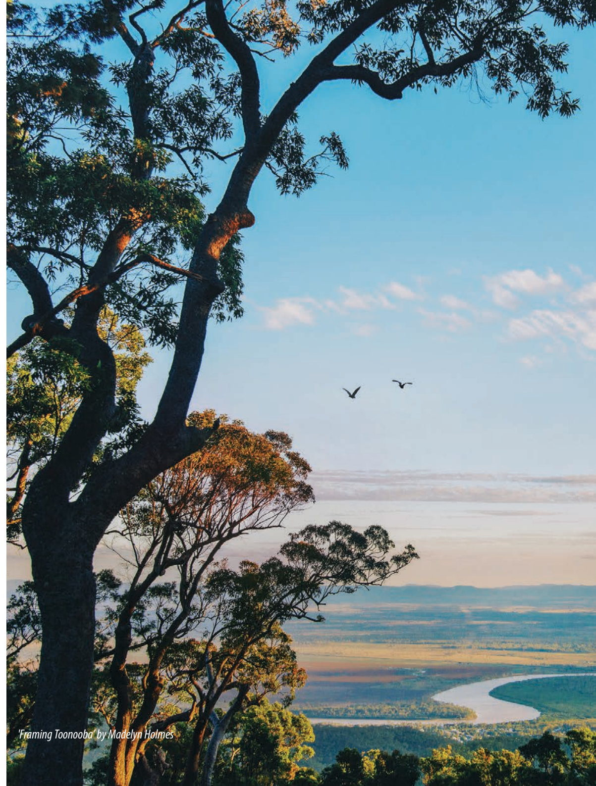
'Framing Toonooba' by Madelyn Holmes

Disclaimer: Information contained in this document is based on available information at the time of writing. All figures and diagrams are indicative only and should be referred to as such. While the Rockhampton Regional Council has exercised reasonable care in preparing this document it does not warrant or represent that it is accurate or complete. Council or its officers accept no responsibility for any loss occasioned to any person acting or refraining from acting in reliance upon any material contained in this document.