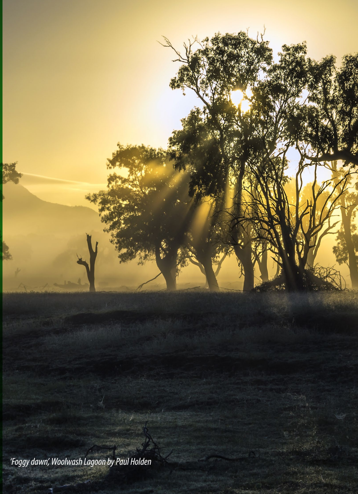
'Foggy dawn', Woolwash Lagoon