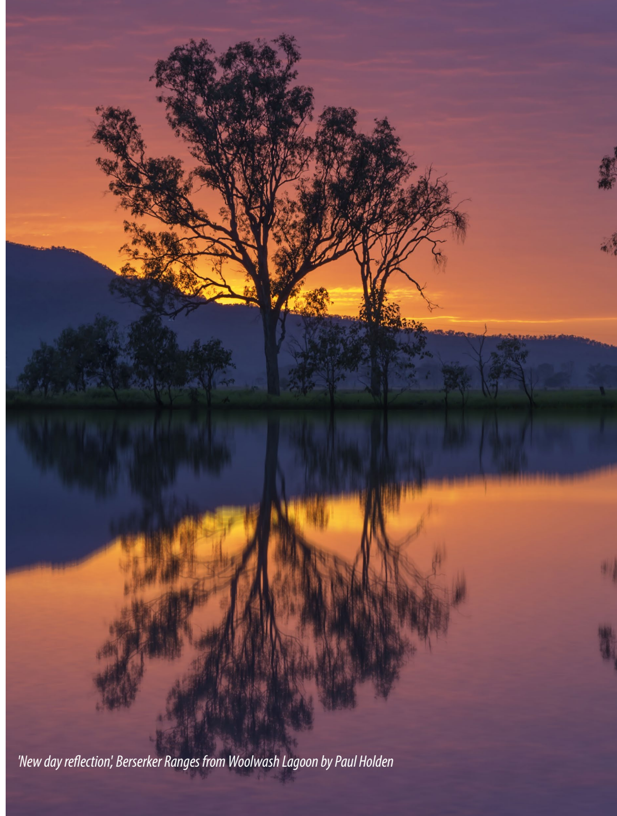
'New day reflection', Berserker Ranges from Woolwash Lagoon by Paul Holden