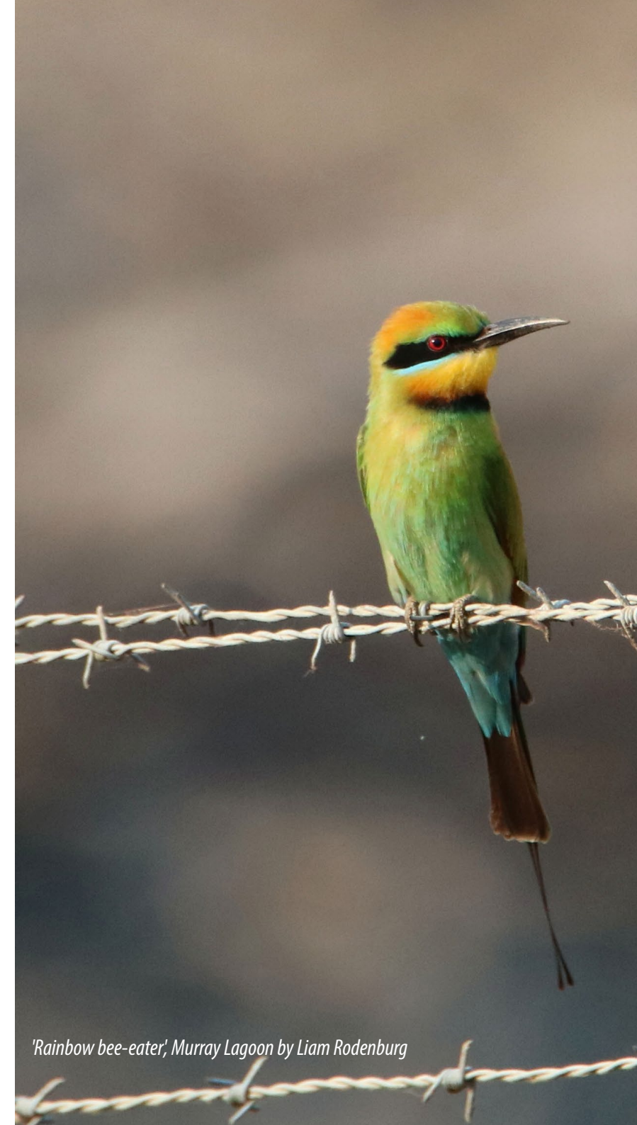
'Rainbow bee-eater', Murray Lagoon by Liam Rodenburg