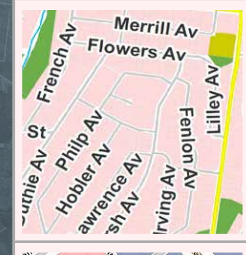
Street View Example