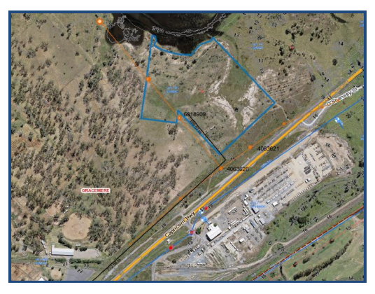
Figure 1 Lot 141 Proposed Animal Pound Location

Current Use: Rural Land (Animal Special Management area)